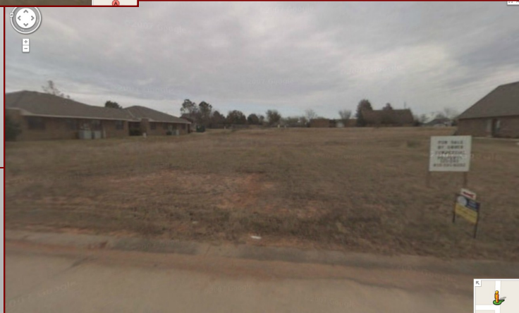
Looking directly at lot from Greenbriar Pkwy