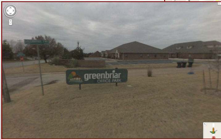
Greenbriar Office Park entrance sign